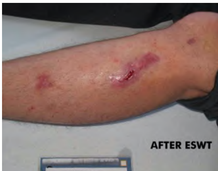
Burn injury Before and after 7 weeks / 4 SWT sessions applied in total