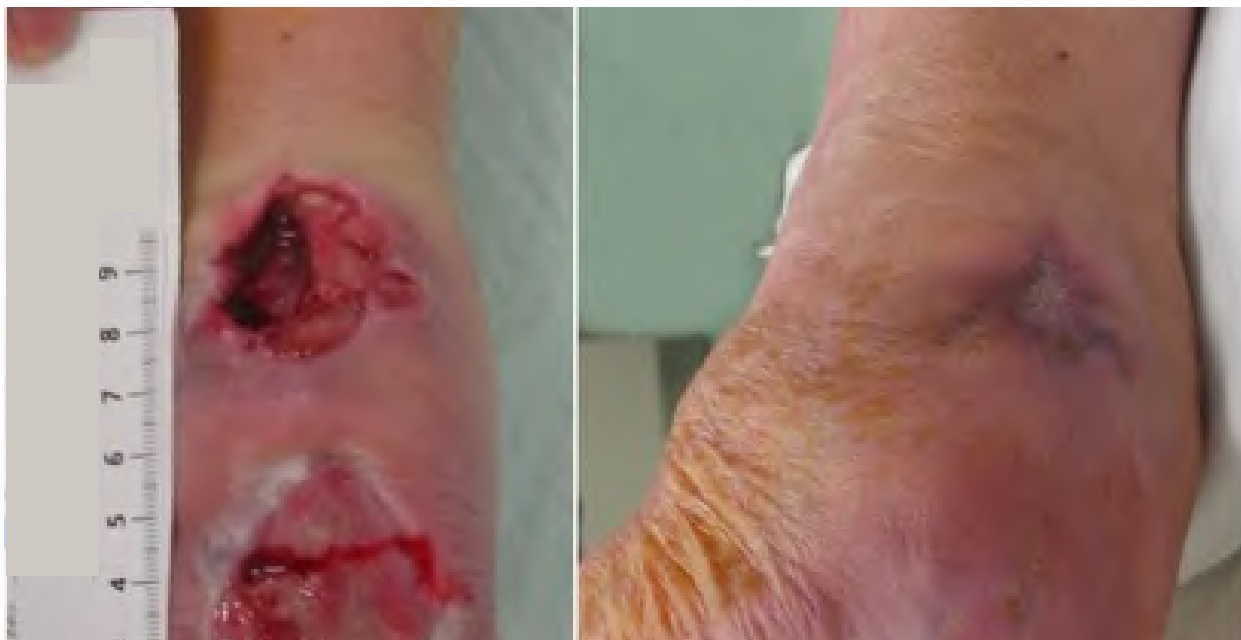
Diabetic foot ulcer after surgical intervention 71 years old, female, diabetic; 5 SWT treatments in total, 2,500 impulses

Although numerous treatment strategies are commonly used to aid healing of DFUs, such as negative pressure wound therapy, ultrasound, recombinant human platelet-derived growth factor-BB, and acellular matrix products, these treatment strategies often have low efficiency, potential side effects, and high costs. 8 Even with individualized care, such as frequent repositioning, debridement, and monitored glucose control, some DFUs fail to progress through the stages of healing. 7 ESWT is a non-invasive treatment method that can have a positive impact on healing DFUs.