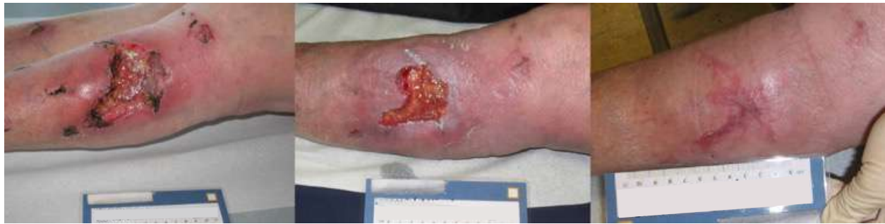
Infected dog bite