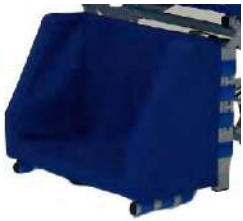
FootBox/ Huntingtons Package