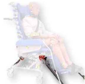
WC19 Transport Option