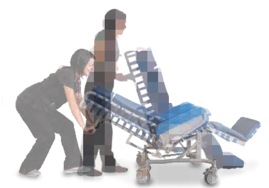
Ease of use/operation with unlimited positioning for enhanced comfort

NPUAP RECOMMENDS SHIFTING WEIGHT IN A CHAIR BOUND RESIDENT EVERY 15 MINUTES. 1