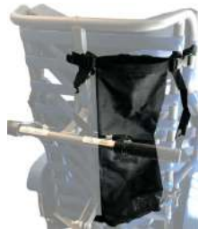
Oxygen Tank Holder